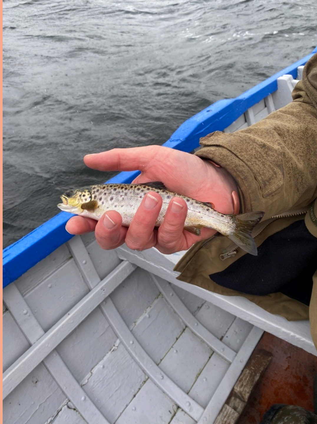
A fish from the Fairy Pool